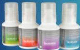
Code: 6466 $1.55 per serving