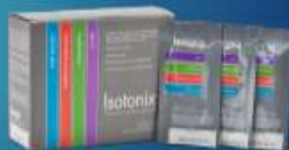
Code: 6496 $2.33 per serving